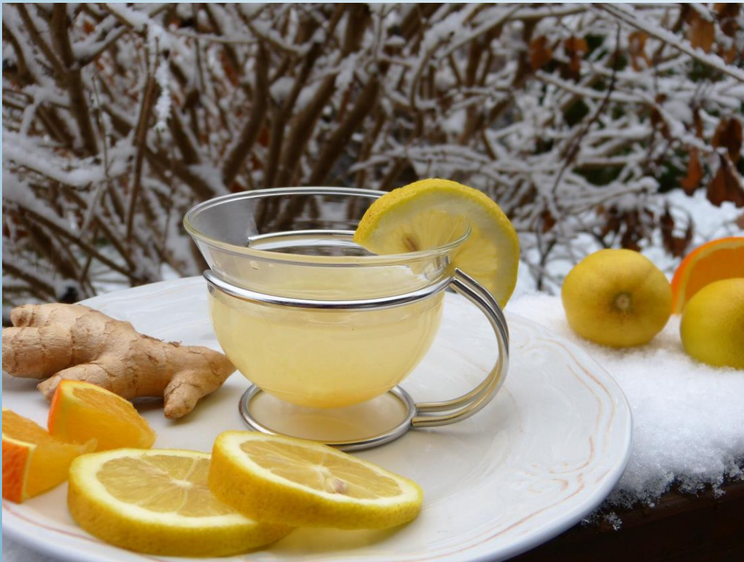
(Silviarita, no date)