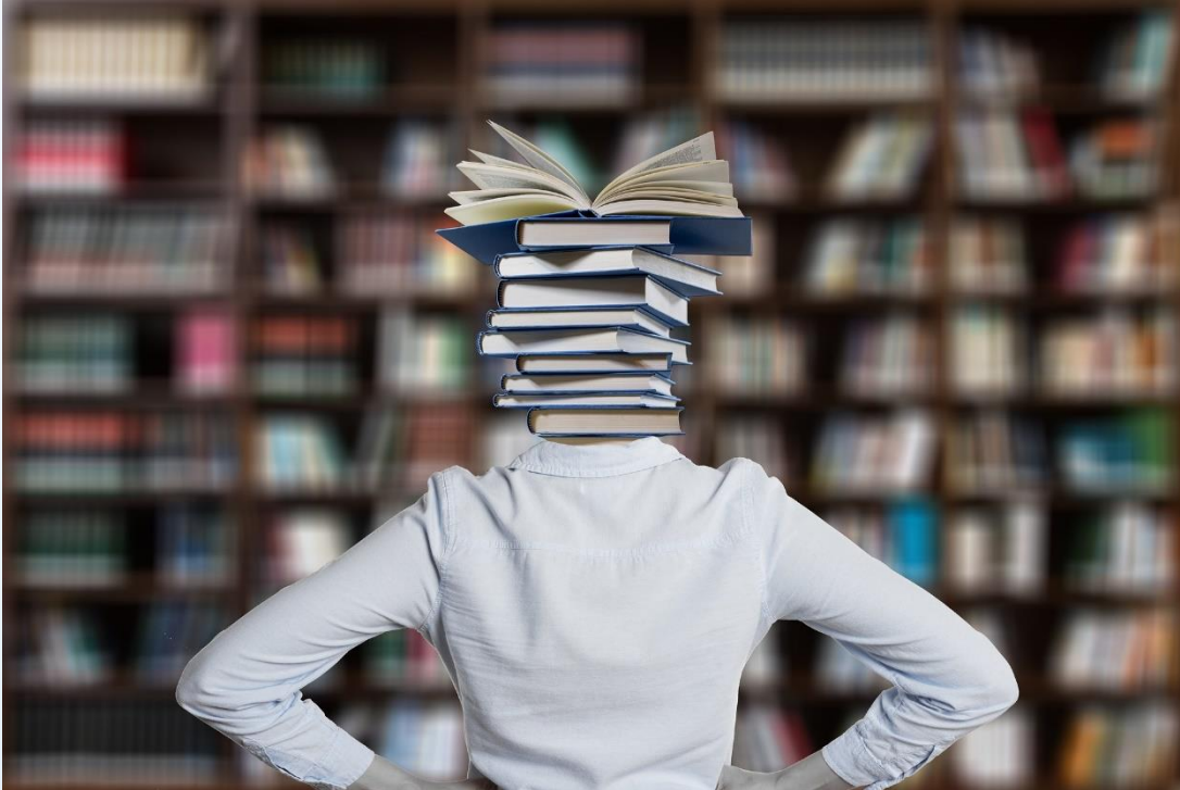
(Altmann, no date)

What does it mean to be a critical reader?